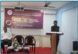
Diksharambh : Student Induction