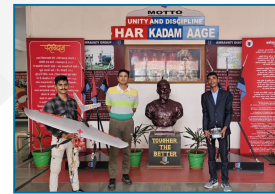
1st Prize winner of "Avishkaar 2025" Now an Entrepreneur of Electronova System Pvt. Ltd. The Robotics Company