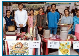
Udyam : Entrepreneurial Skills Development