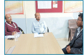
Campus Internship Week