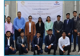
Campus Placement Drives Selected Candidates with HR