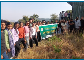
ENVIRO Club Visit at Chikhaldara