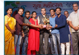
1st Prize Winner (Drama) Youth Festival 2025 Organized by SGB Amravati University