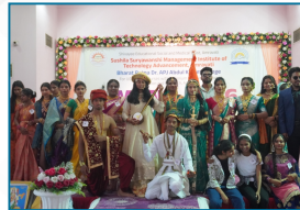
Umang 2026 Cultural Event