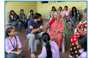
Diwali Milan : Social Outreach